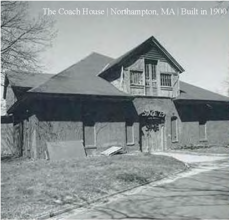
The Coach House | Northampton, MA | Built in 1900