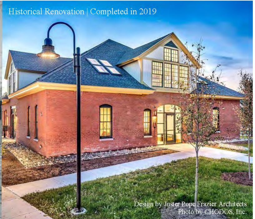
Design by Juster Pope Frazier Architects