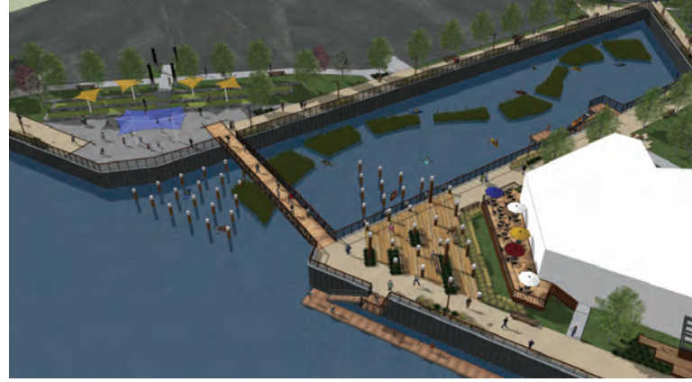
VILLAGE OF PORT CHESTER – STREETSCAPE PLACE ALLIANCE