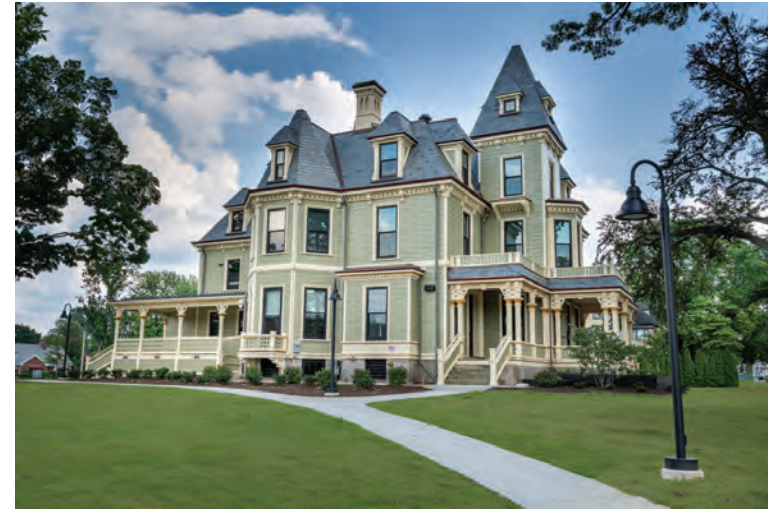
ELMS COLLEGE GAYLORD MANSION KUHNS RIDDLE ARCHITECTS