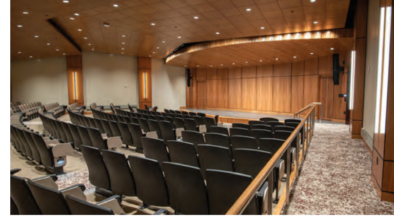
FURCOLO HALL - UMASS KUHNS RIDDLE ARCHITECTS