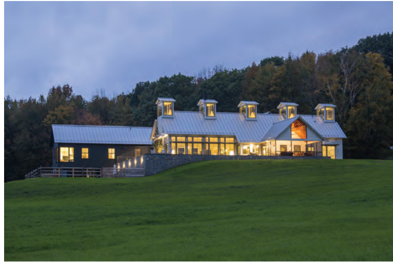
BACK TO THE COUNTRY BURR & MCCALLUM ARCHITECTS