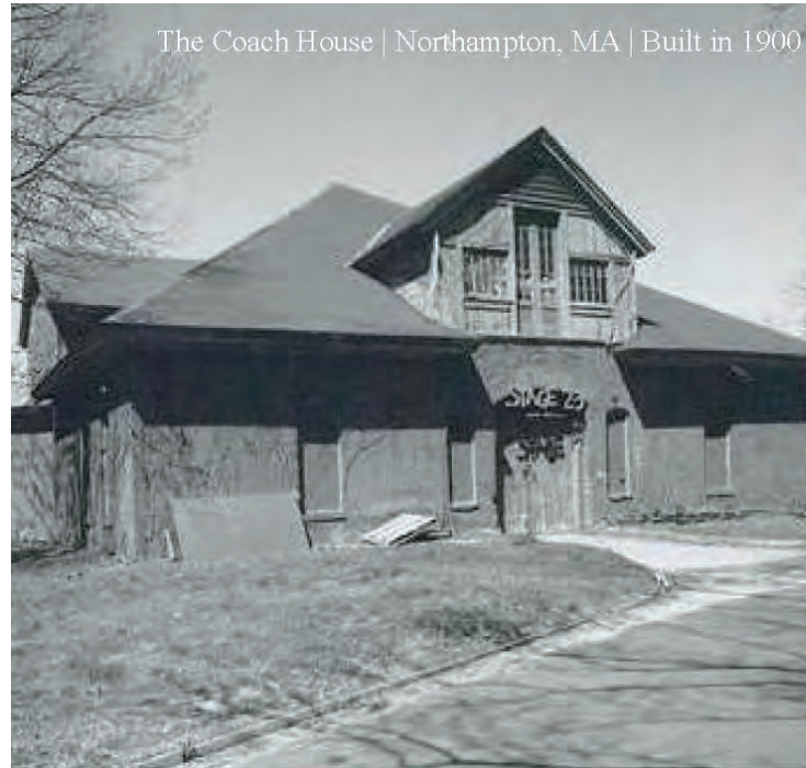
The Coach House | Northampton, MA | Built in 1900