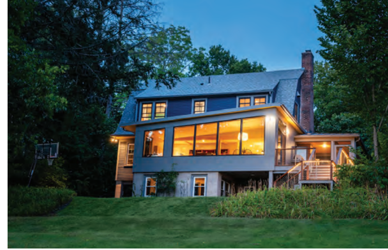
SUNSET C&H ARCHITECTS