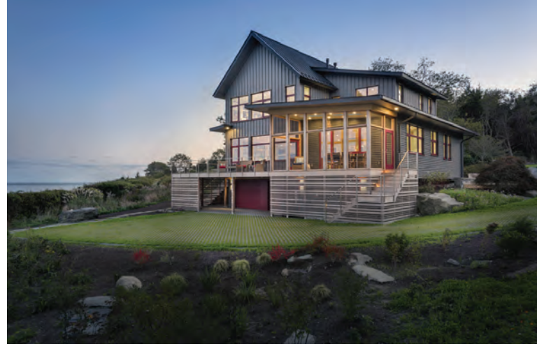
LOW IMPACT HIGH END C&H ARCHITECTS

INTERESTED IN ADVERTISING IN THE WMAIA NEWSLETTER? CONTACT DIRECTOR@WMAIA.ORG FOR MORE INFORMATION!