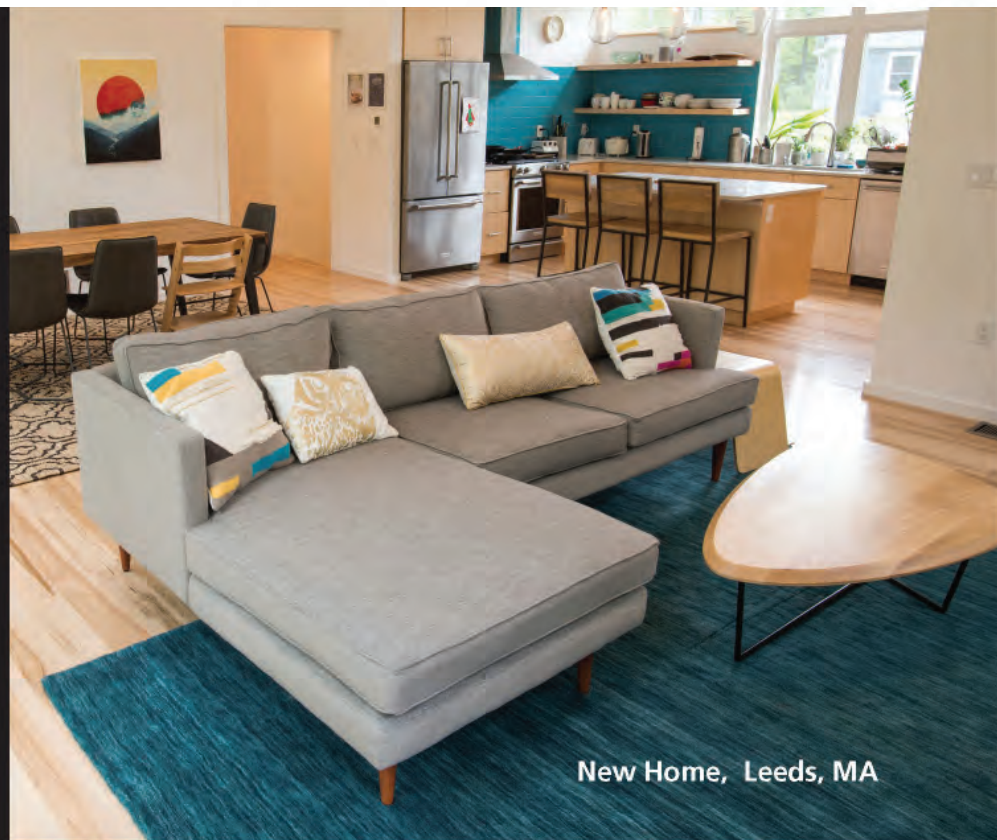
New Home, Leeds, MA

Florence, MA • 413-586-8600 KeiterBuilders.com