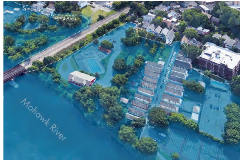
STOCKADE HISTORIC DISTRICT FLOOD MITIGATION STRATEGY PLACE ALLIANCE