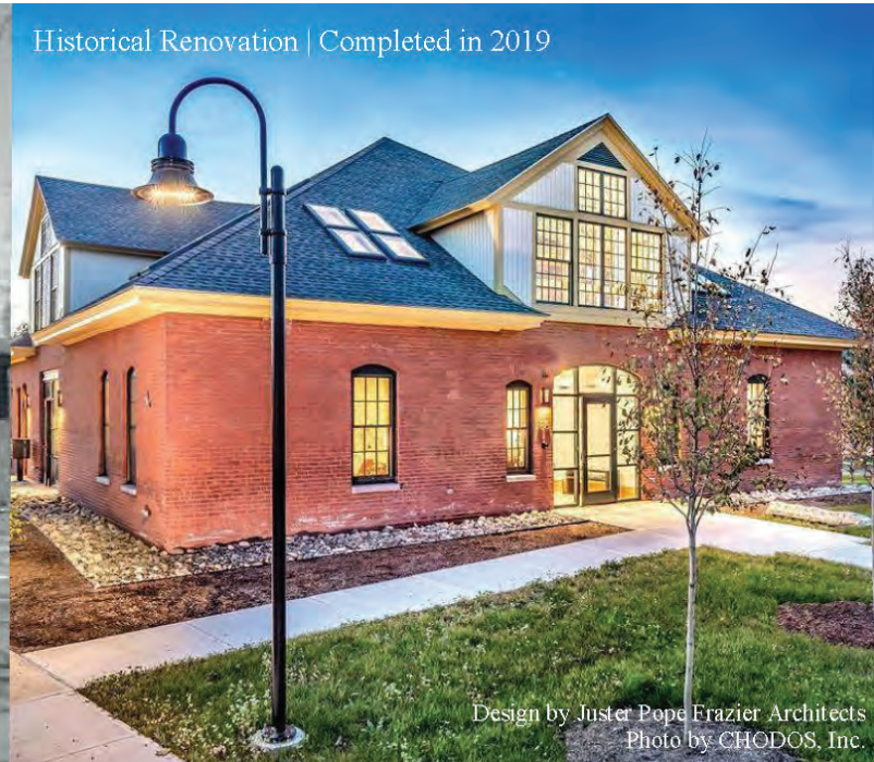
Historical Renovation | Completed in 2019

Design by Juster Pope Frazier Architects