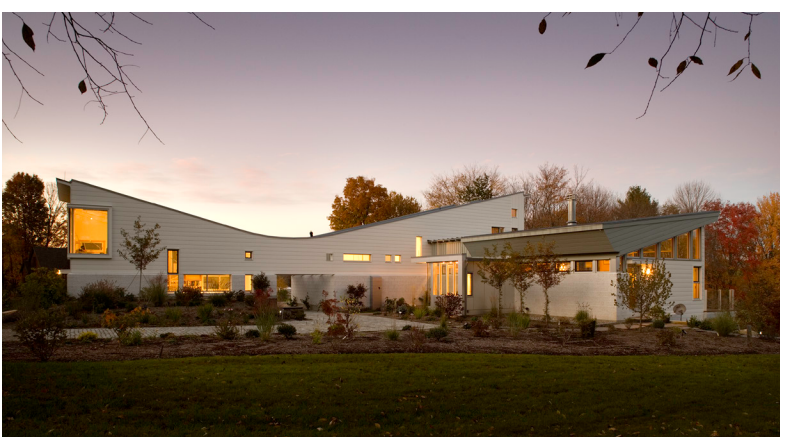
1290 Studio and Residence, completed 2007