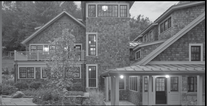
James Estes Estes/Twombly Architects Inc. Block Island, Rhode Island