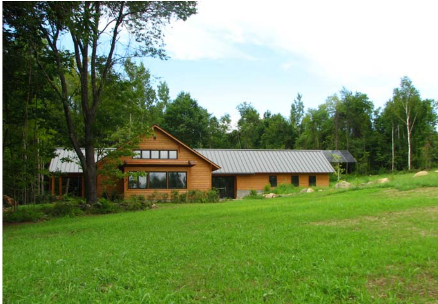
Coldham&Hartman’s recently completed Smith College Bechtel Environmental Classroom at the MacLeish Field Station in Whatley, MA

Like other high-bar building performance measurement programs, such as LEED Green Building Rating System and Passive House, LBC measures a project’s sustainability according to a system designed to categorize and quantify key factors. In the LBC, in order to be certified as ‘Living’, a building must meet the full list of 20 requirements (‘Imperatives’) after 12 months of full building occupancy. The program involves the architect, as well as owners and occupants in the design and operation of the building. Imperatives are distributed across seven categories