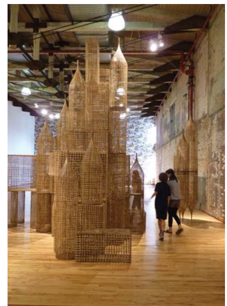
View of Cambodian artist Soheap Pich's installation titled, "Compound" at Mass MoCA's 'Invisible Cities' exhibition. Open through February 4, 2013.

For those who are feeling that critical, yet accessible writing about architecture and design is disappearing from our landscape, give Design Observer a try. Articles are posted daily on topics as large as the significance of the civic space in shaping modern society to those as small as the role of the protest posters seen in those public spaces. http://designobserver.com/