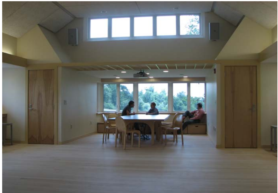
Inside the main Seminar Room of the Bechtel Environmental Classroom building.

quality, but does not address the same range of concerns as LBC (water, material and site choices, among others) and does not demand net-zero energy.