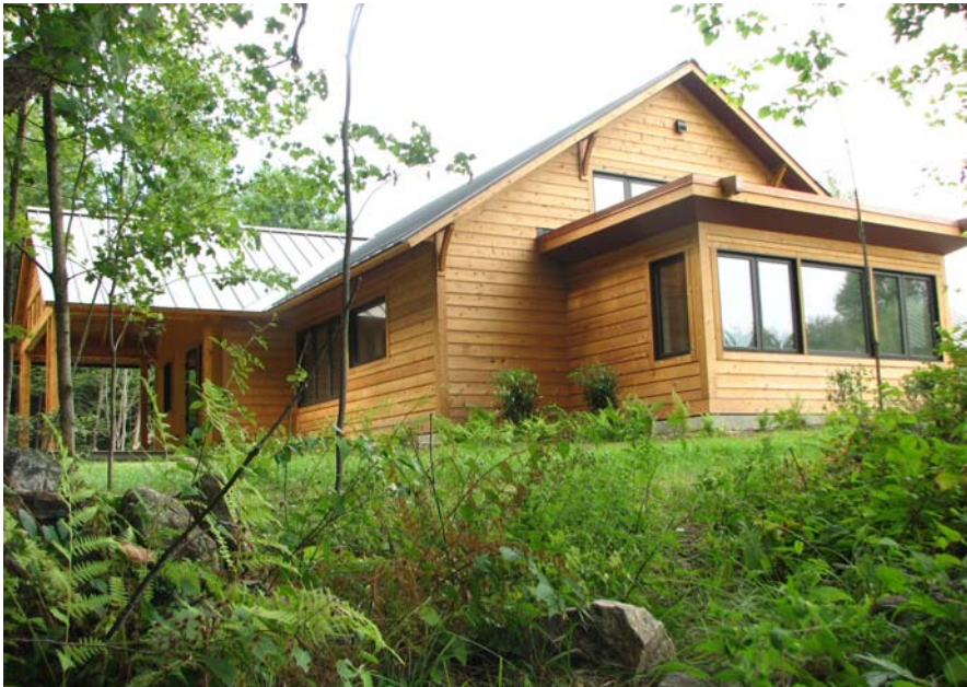
The building in the site. photo by Coldham&Hartman Architects

through a super insulated envelope, daylighting and efficient lighting and mechanical systems. Net-zero water is also achieved through the use of an on-site well and composting toilets. These are impressive accomplishments, but to meet the LBC standard, the building also had to meet the Imperatives of the remaining Petal categories. In Materials, the requirement to avoid the Red List, was a challenge -- all building materials, from the studs to the duct silencers, to the paint on the walls had to comply with extremely low toxicity requirements. Coldham&Hartman, with consultant Lorin Starr Interiors, took the Red List one step farther than requirements by also applying it to the interior furnishings to the extent possible. Embodied carbon for all materials had to be accounted for and materials had to be sourced within a local radius.