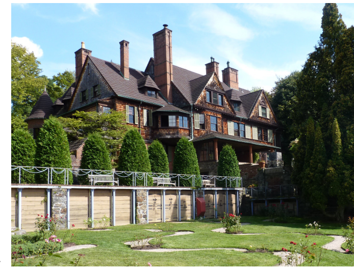
Naumkeag from the rose garden

of Many the construction details are also compelling. The house is wood construction. it features but concrete floor slabs and а fully integrated, gravity fed water system hose reduce the to potential for loss in the event of fire