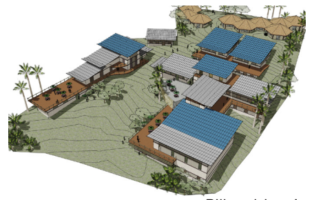
Bill and Joan's design for a new school in rural Haiti rendering by Bill Austin AIA

When we finally arrived at sites, we were struck by how beautiful the surrounding country is. What an opportunity to do something wonderful and so needed. My existential angst is now diminished. We can make a difference here. The process of getting the schools built will be difficult, not the least because we still need to raise the money. But these schools will be solid and safe; and, hopefully along with the natural beauty of the countryside, inspiring and a perfect place to learn.