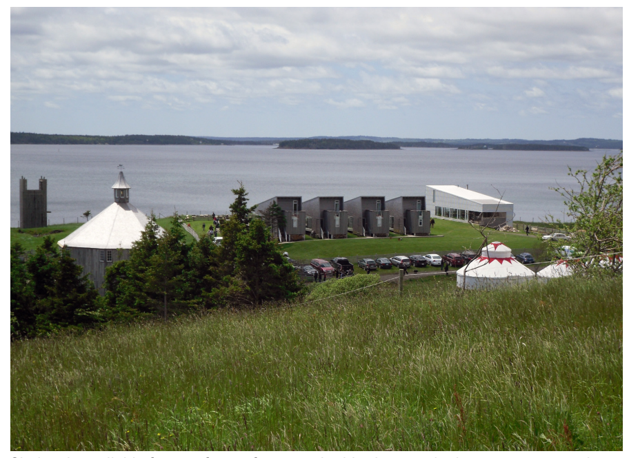
Shobac is available for rent for conferences. In this view are the barn, cottages, and conference building.

Overall, the conference dealt with issues of sustainability, regionalism, education, art, and craft. The roster of presenters was incredible, representing talent from all over the world. There was a small sense of an "old boys club" in that many had been each other's students or teachers or had participated in earlier Ghost events, and in the unspoken requirement