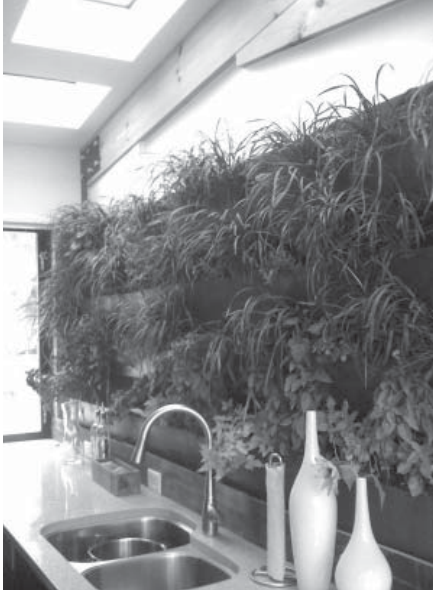
Penn State's Living Wall