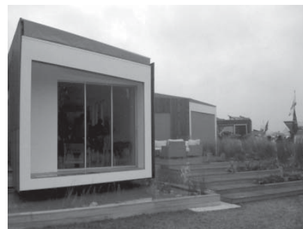
Team California's Refract House

Team California pulled into an early lead as the competition week began, getting a big boost from their 'architecture'