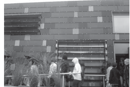
Darmstadt, surPLUS House

While many have criticized the expense (and hassle) of developing the Solar Decathlon houses, and the high carbon footprint of dragging them to D.C., it is clear to me that each of these projects has in some important way permanently altered the culture of their respective institutions by bringing students, faculty, administrators, businesses and people in general together in an unprecedented collaboration. DOE was quite strategic in understanding it would take just such a 'crazy' mechanism to set such long-term changes in motion. At the time of my D.C. visit, I was just over one month away from the Request For Proposal deadline, and three weeks out from